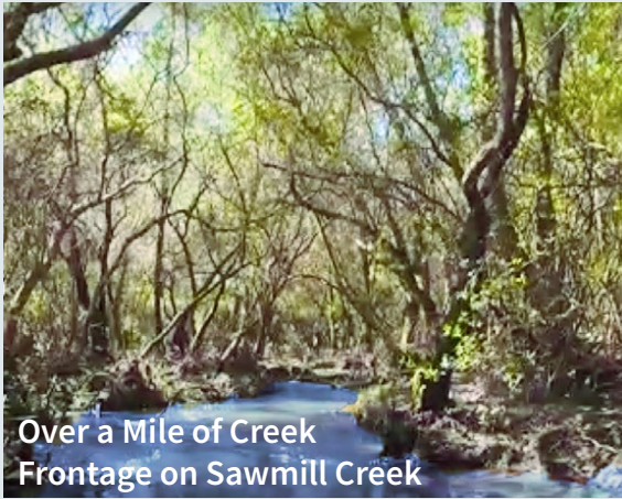
Over a Mile of Creek Frontage on Sawmill Creek

320± Acres In Mobile County, Alabama $1,920,000